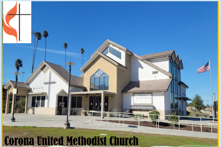
Corona United Methodist Church