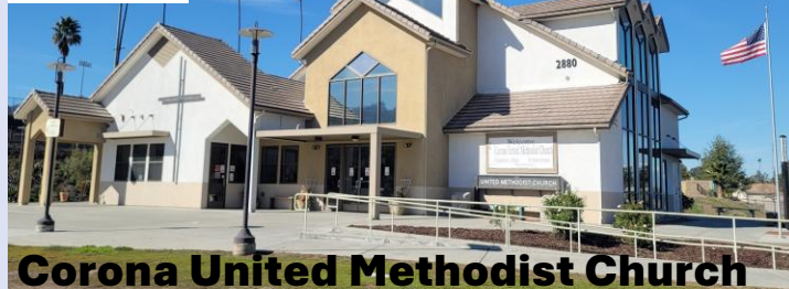
Corona United Methodist Church