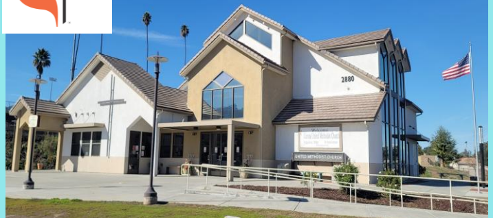
Corona United Methodist Church