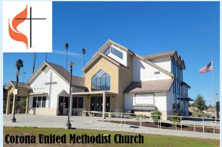
Corona United Methodist Church