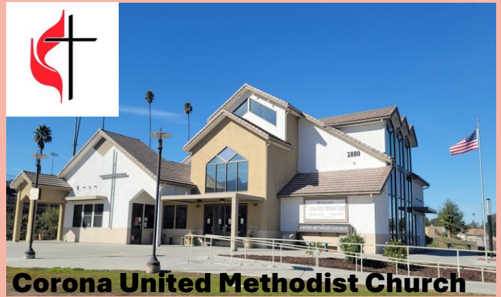
Corona United Methodist Church