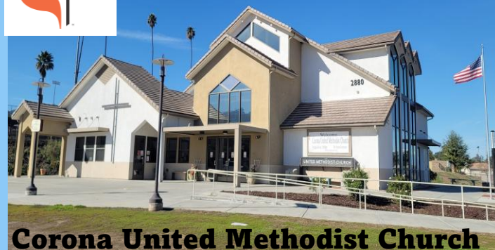
Corona United Methodist Church