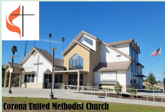
Corona United Methodist Church