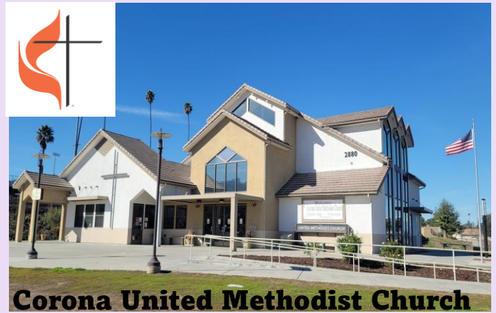
Corona United Methodist Church